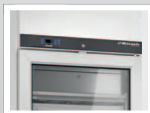
Glas door with lock Avoid opening the door unnecessarily to inspect contents. Can be locked.